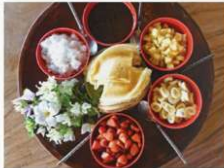
CLOCKWISE FROM LEFT Balinese pancakes served at The Longhouse; The clear waters of Balangan Beach; The intricate carvings of a Balinese house; The traditional 'Puri' dance; The West Java room at The Longhouse